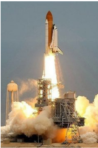
Space Shuttle Atlantis blasts off on May 11, 2009.