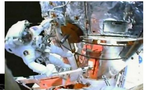
Brother Feustel is shown in these three photos repairing the Hubble Telescope during his spacewalks.